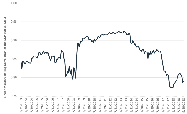
As of September 30, 2018