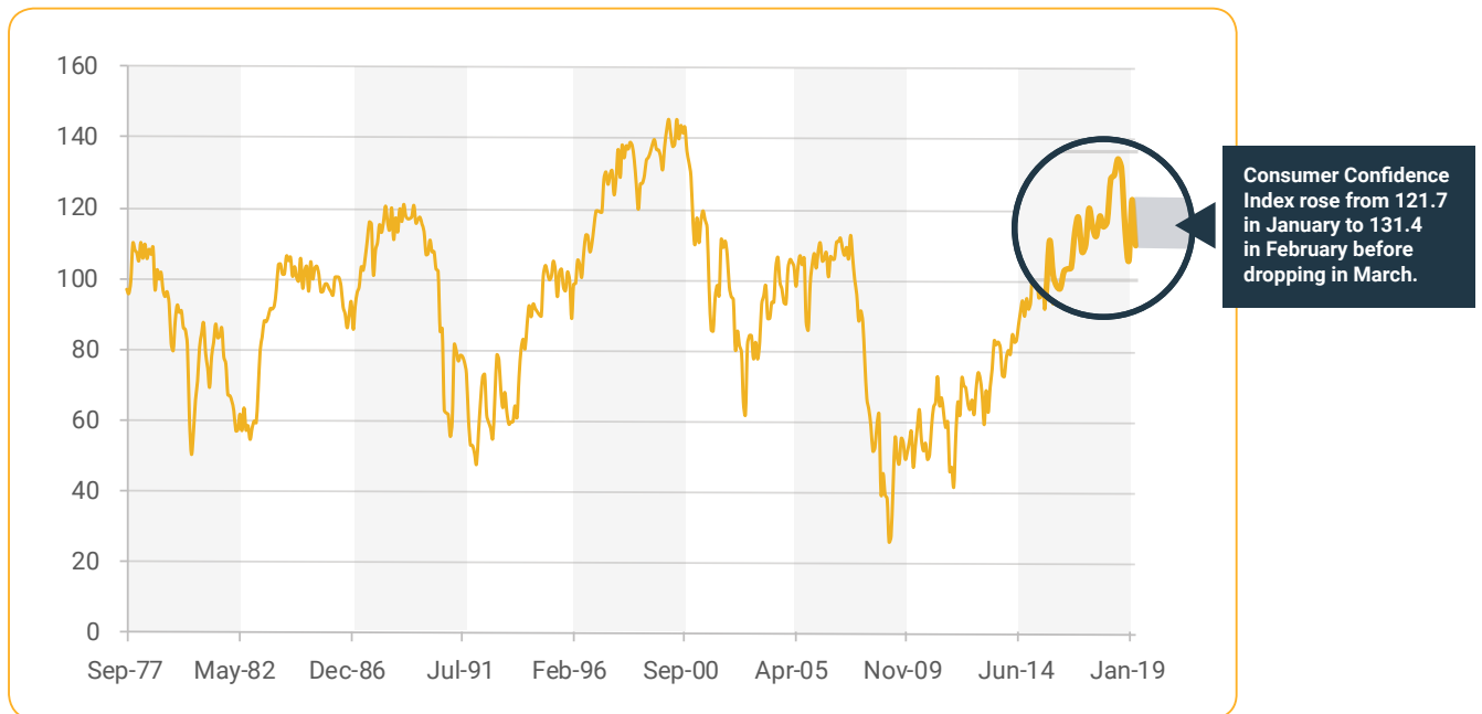
Confidence has rebounded post-Q4 market moves Conference Board Consumer Confidence Index (9/30/1977 – 3/22/2019)

Consumer confidence indices may have pulled back from recent highs, but they remain at the upper end of their historic range. Solid jobs growth has helped sustain that optimism, despite not having strong wage growth. Consumer confidence has also helped offset some damage from trade concerns, which is important, since a consumption-based economy depends on consumers feeling comfortable spending money.