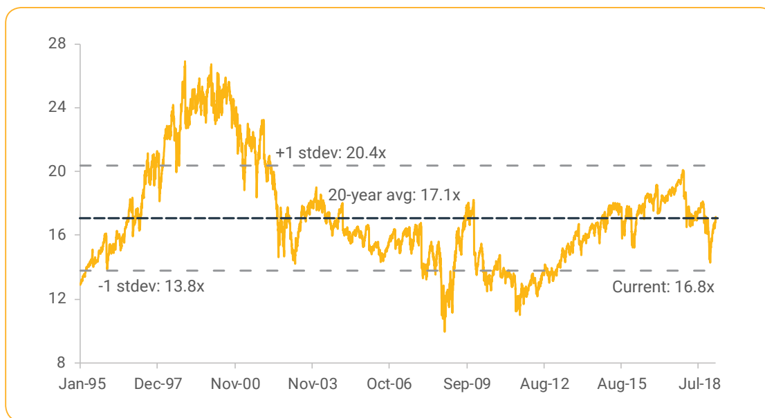
Valuations have normalized S&P 500 Index 12-month forward P/E

Price to earnings is price divided by consensus analyst estimates of earnings per share for the next 12 months as provided by IBES since December 1989, and FactSet for March 22, 2019. Average P/E and standard deviations are calculated using 25 years of FactSet history. Std. dev. over-/under-valued is calculated using the average and standard deviation over 20 years for each measure. Forecasts are represented by consensus FactSet analyst views. Past performance is not a guarantee of future results.